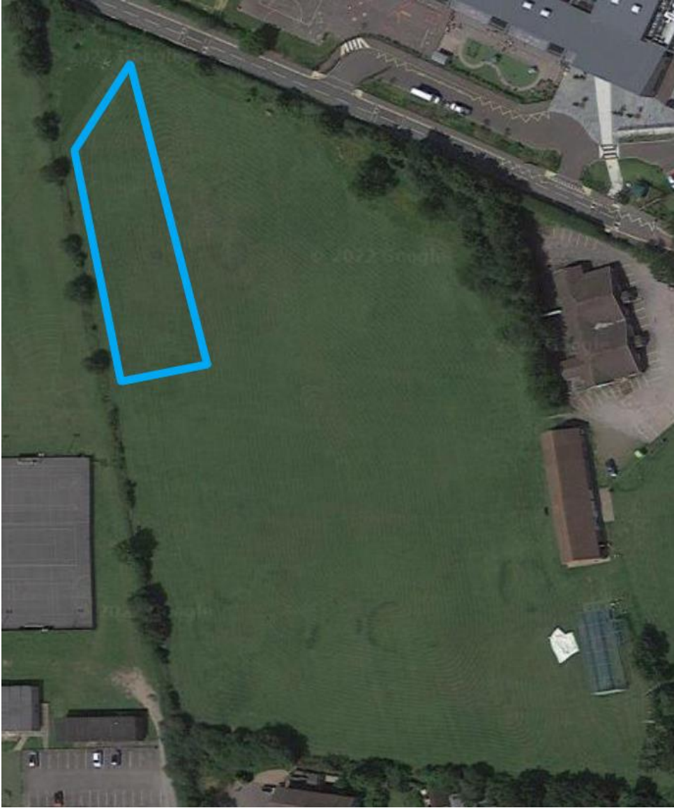
Proposed location of Hebborns Family Funfair